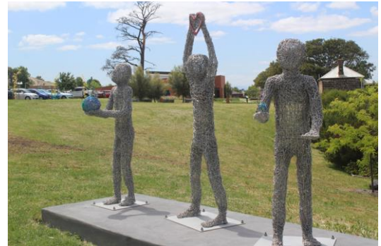
Wire sculptures at Mother Teresa PS, Mt Ridley

The notion of neighbour is one we have explored many times as a learning community. Our wire statues, so visible on our property, are one representation of our understanding of neighbour - care for our common home, care for the vulnerable and in the centre love for all. Our neighbour is one we are encouraged to see face to face, acknowledging the loving of my neighbour as myself.